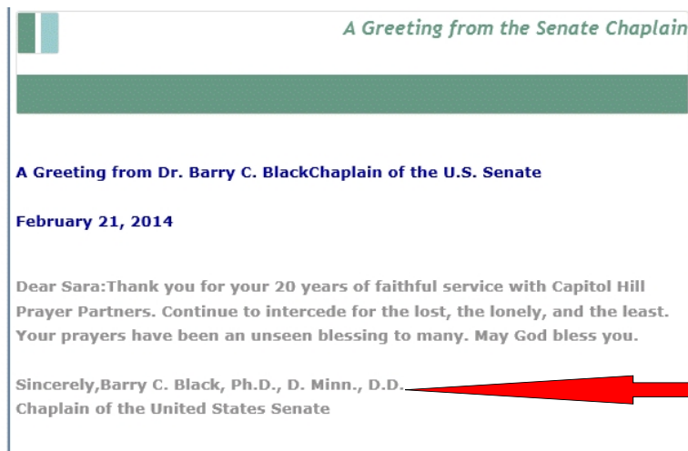
Screen Shot - Taken 27 August 2018