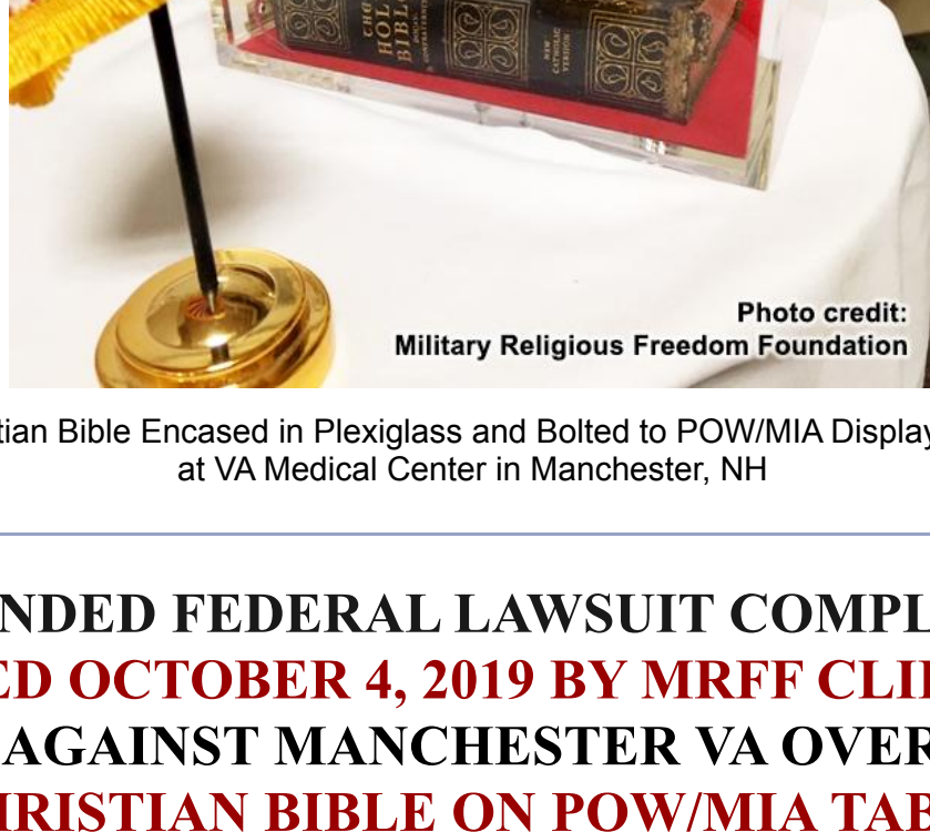
Christian Bible Encased in Plexiglass and Bolted to POW/MIA Display Table at VA Medical Center in Manchester, NH