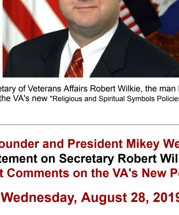
Secretary of Veterans Affairs Robert Wilkie, the man behind the VA's new "Religious and Spiritual Symbols Policies"

VA's new policy announcement came just over 7 weeks after MRFF client filed federal lawsuit to get Bible removed from Manchester, NH Veterans Medical Facility.