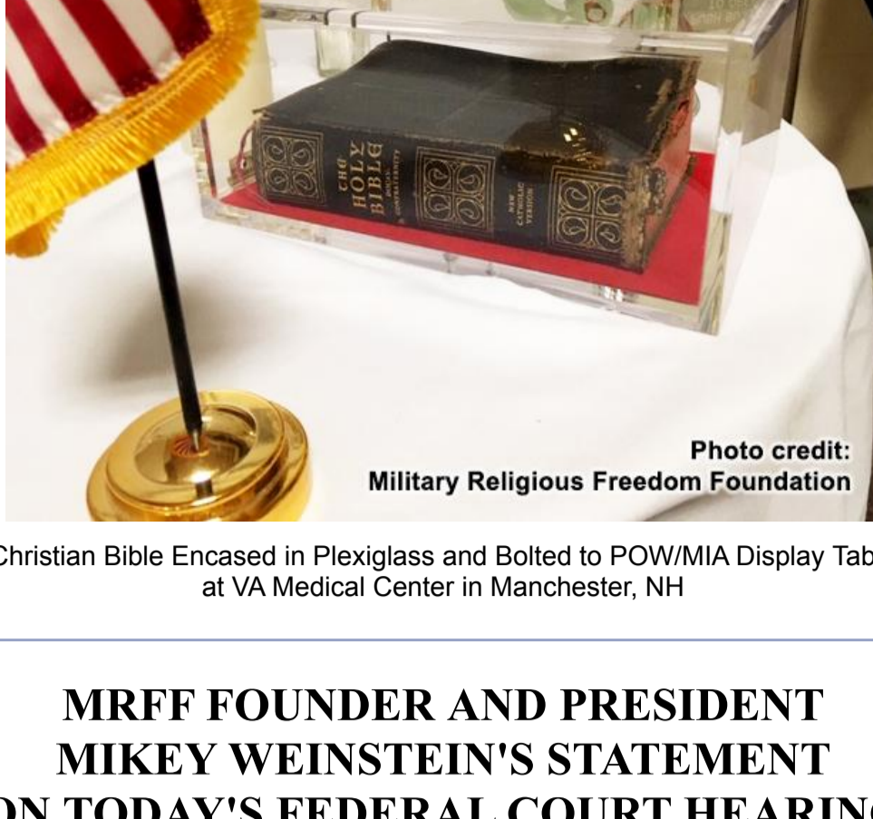
Christian Bible Encased in Plexiglass and Bolted to POW/MIA Display Table at VA Medical Center in Manchester, NH