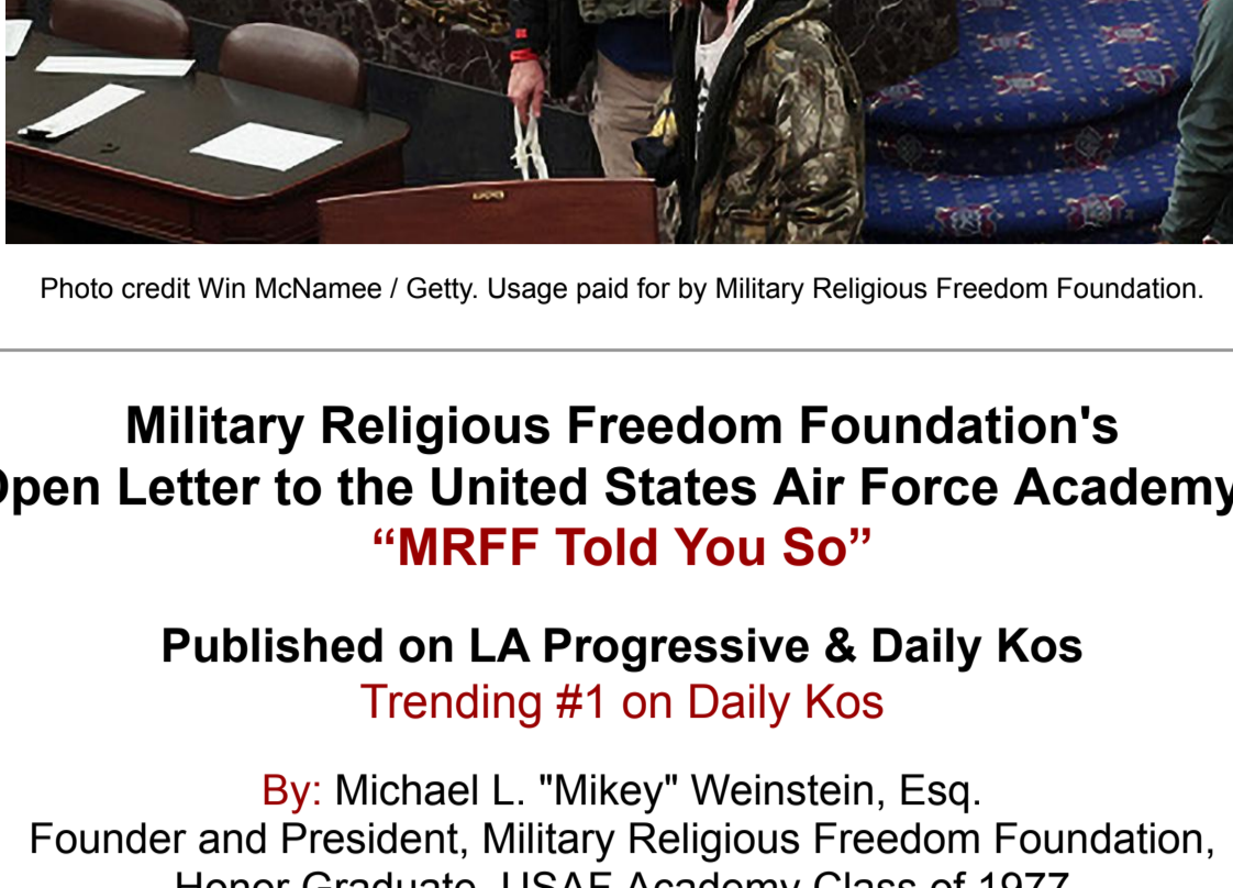
Usage paid for by Military Religious Freedom Foundation.

(Photo of Lt. Col. Brock holding zip ties and wearing combat helmet on U.S. Senate floor during insurrection on 1/6/21)